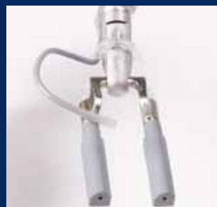
Optional Integrated Blower-Mister