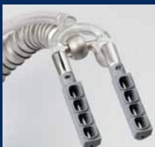
Soft-Touch Rotating Footpads